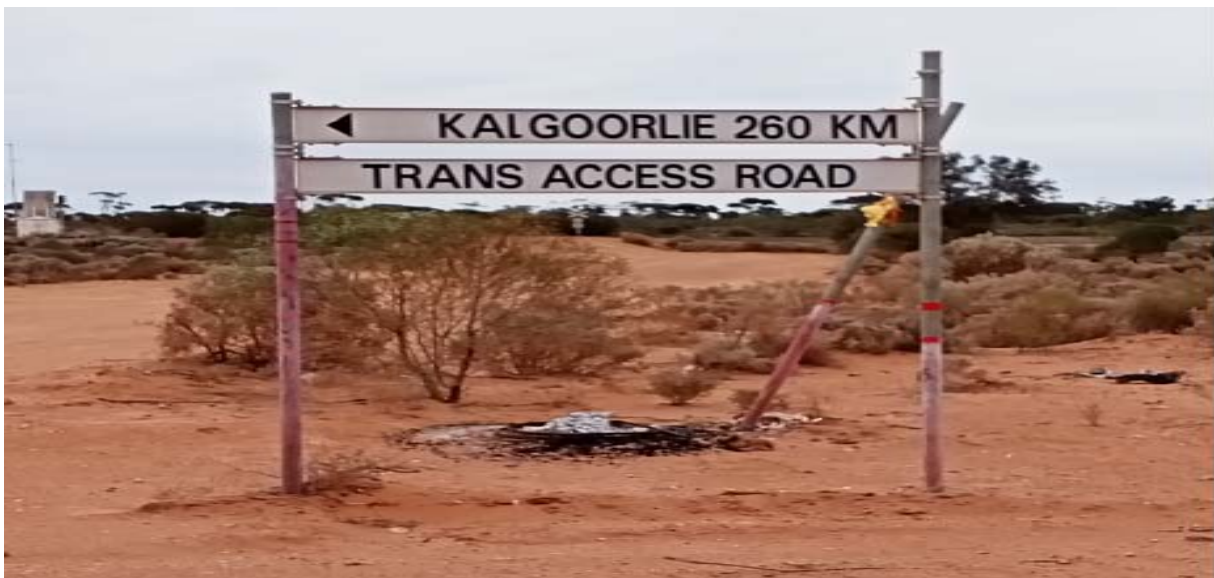
Front of sign