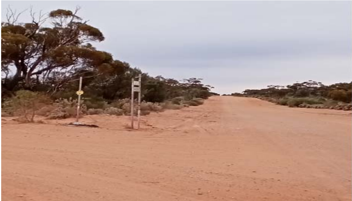
Signage: When you are driving towards it

It is important to note the sign can be easily missed if you are not concentrating. Signage is not facing towards you when driving towards it (Refer to photo below).